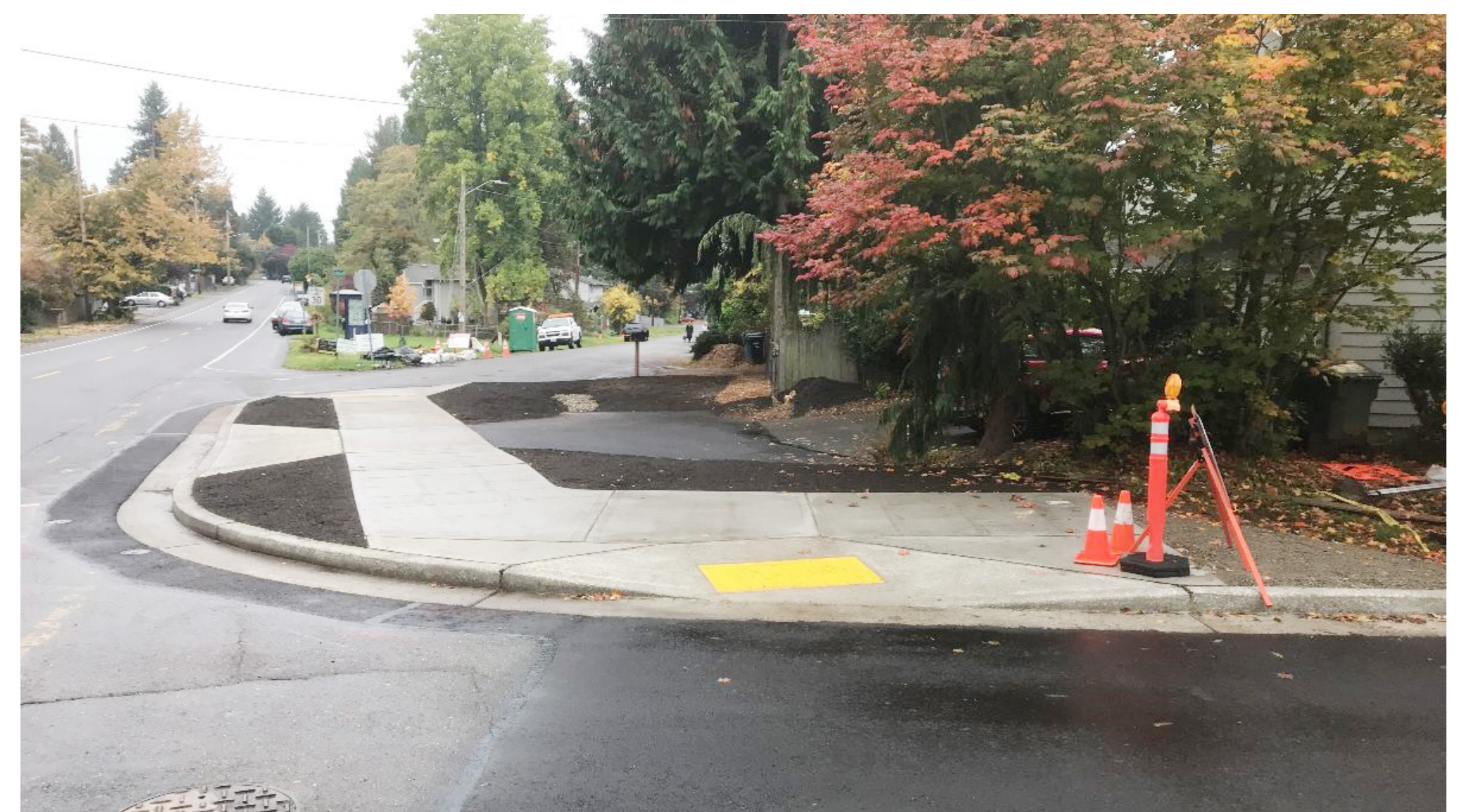
Curb bulb replacement before and after on Sand Point Way NE and NE 125th St