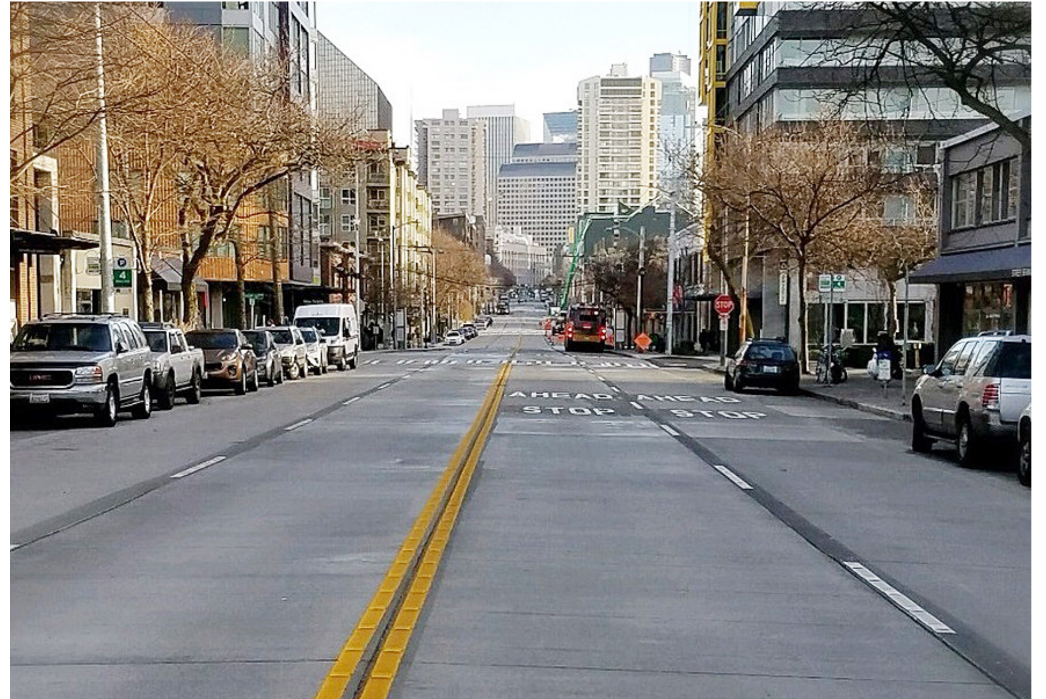
Paving before and after on 3rd Ave