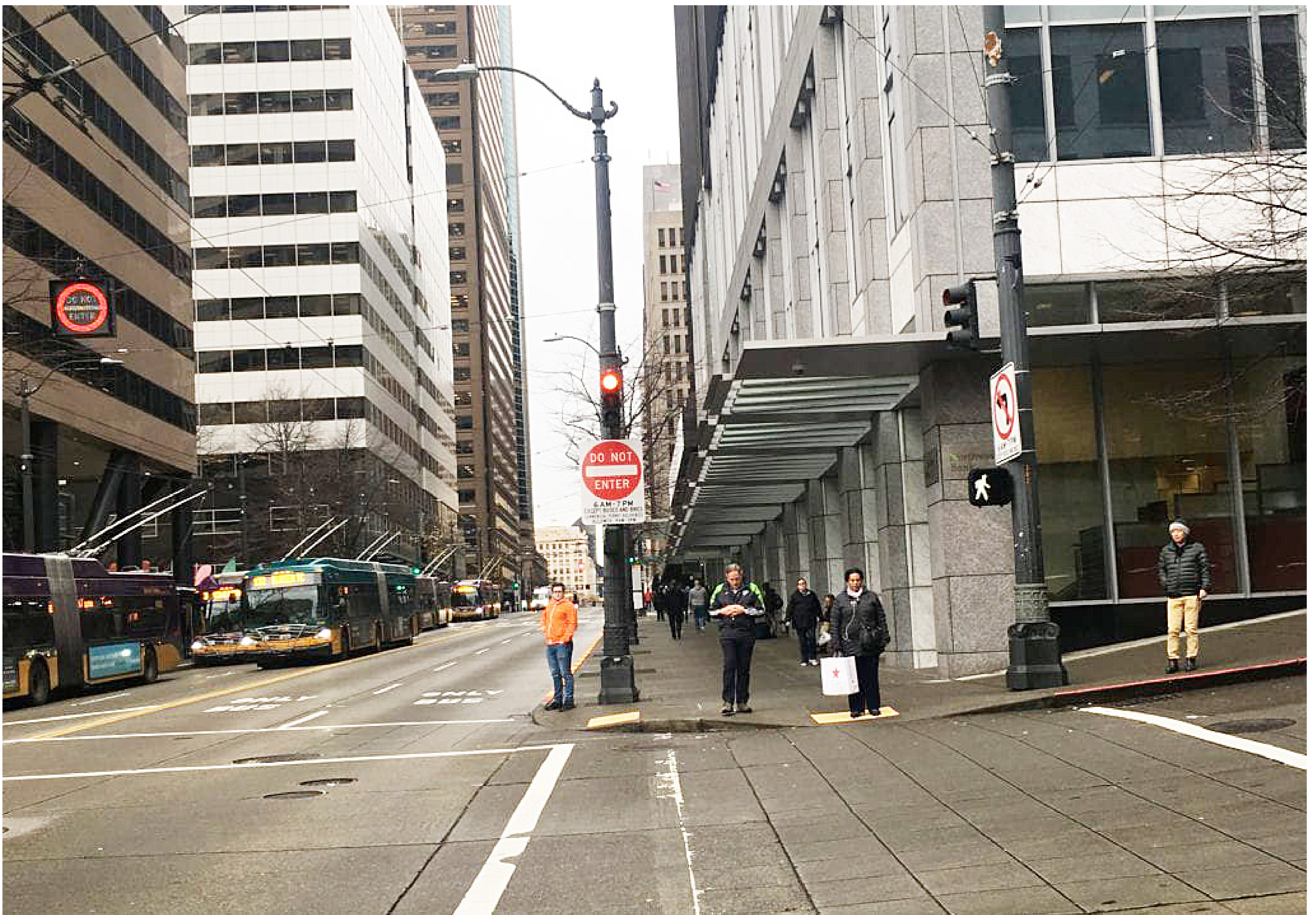
Leading pedestrian signal in action at 3rd and Marion.